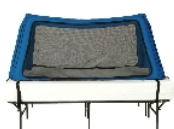
Cette tente est disponible sur demande