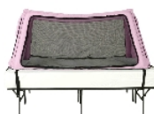
Cette tente est disponible sur demande